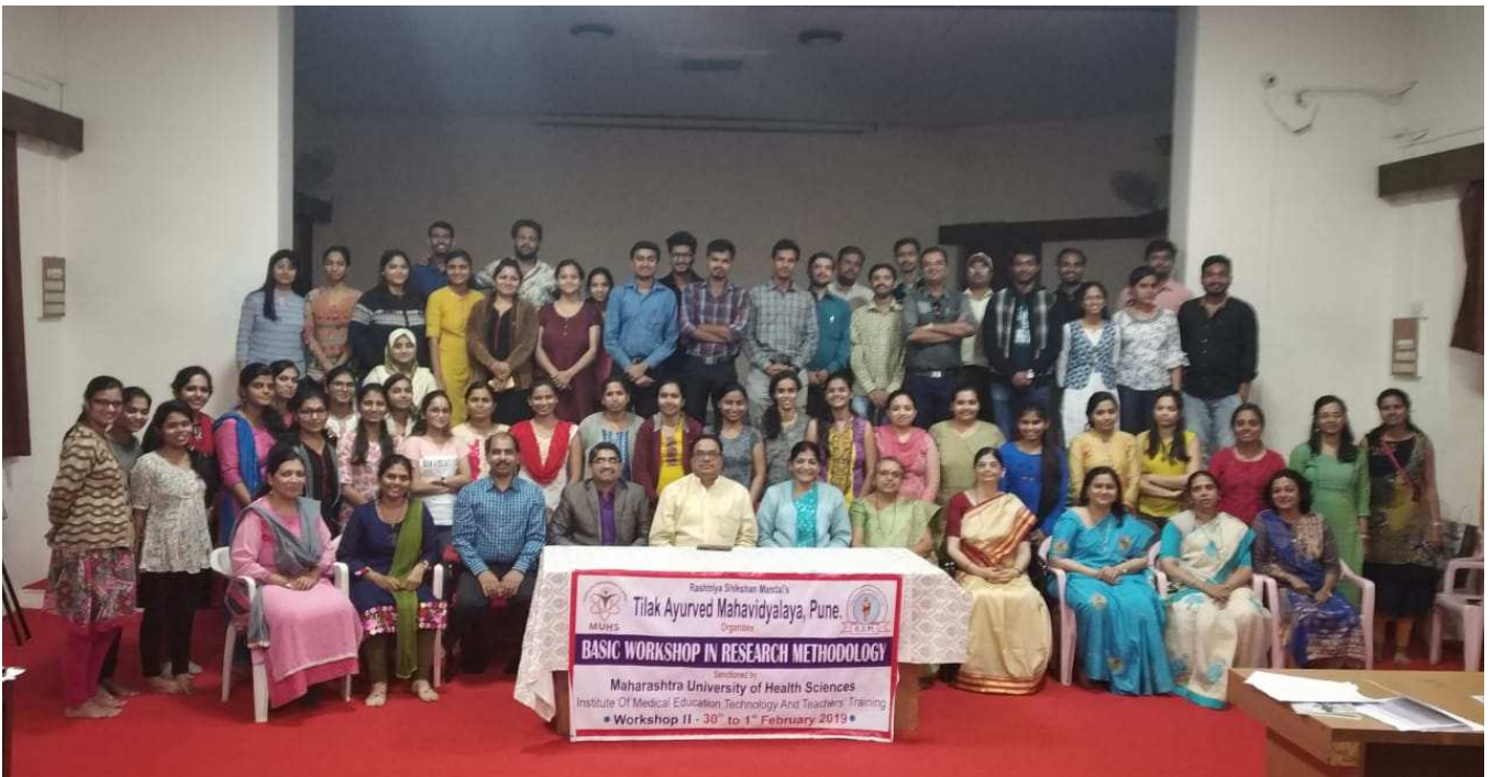
Faculty & Students participated in the Basic Research Methodology Workshop.