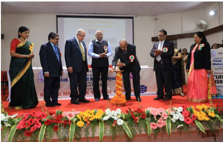
Inaugural function Enlightening of lamp

1 National Seminar on life style disorders by kriya sharir department on 22september 2019