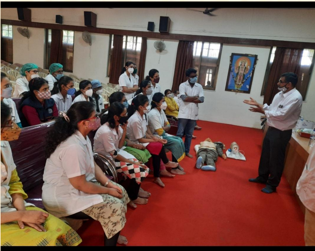
Basic Life Support Workshop on 25-11-2020