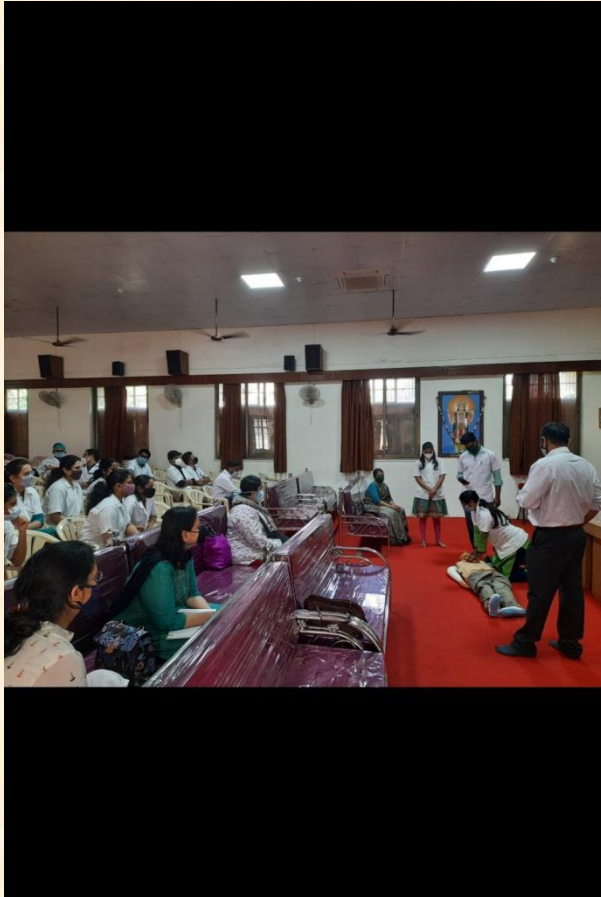
Basic Life Support Workshop on 25-11-2020