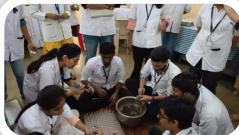
Herbal Shampoo filling & packaging

Units produced – 200 bottles of 40ml each