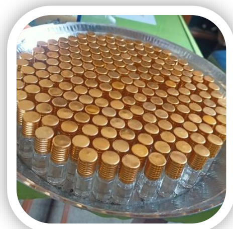
Pain Palm product arrangement

Units produced – 260 bottles of 3ml each