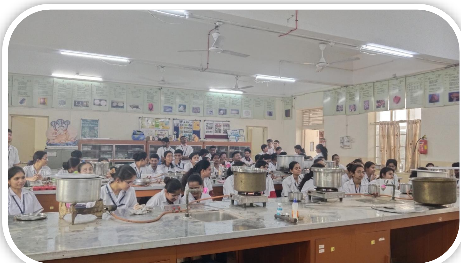
II Year students in Rasashastra Lab with their products