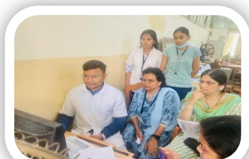
Preparation of Product Templates on Lab Computer under Guidance of mentors