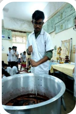
Student preparing Abhyanga Taila