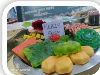
Herbal Soap Display